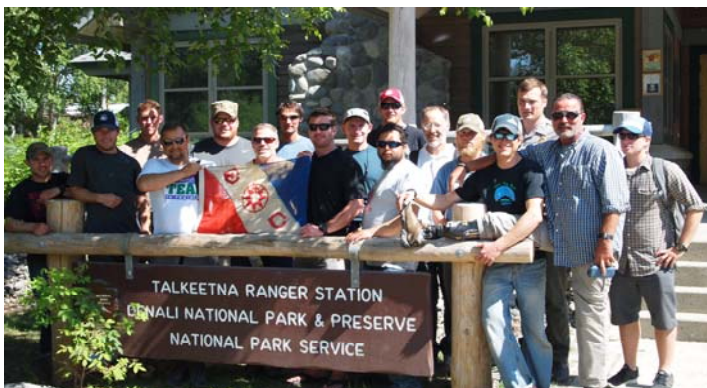
The 2012 Wounded Warrior expedition